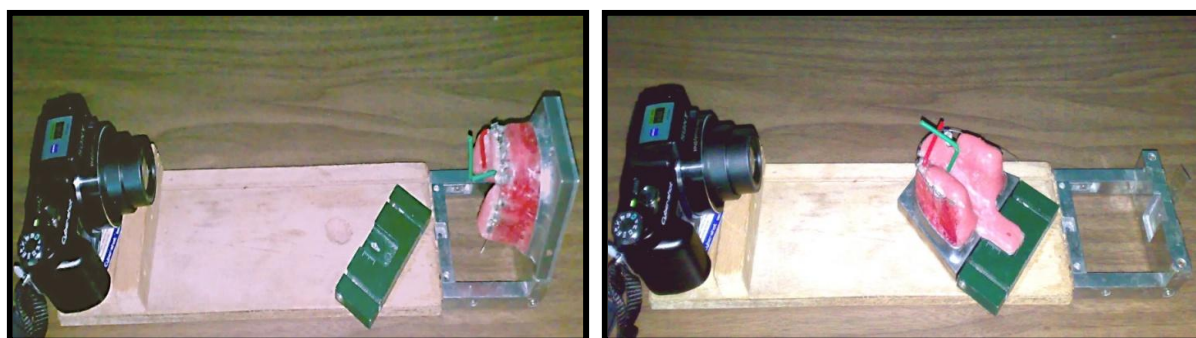
Figure (2): Measurements of canine rotation and tipping.

angle so degree of canine rotation = canine's bar original angle (90°)-canine's bar rotationangle.